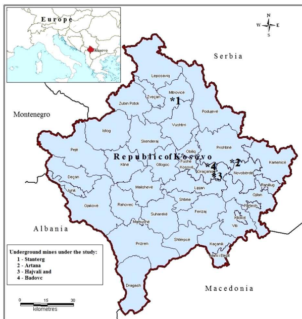
Figure 1. Location map of Kosovo underground mines under the study.

Underground miners are also the subject of the external gamma radiation. The gamma exposure (dose rate) was determined using fully