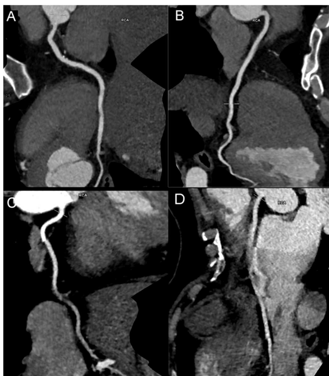
Figure 2. Subjective image quality was evaluated using a 4-point scale: 1 = excellent, no artifacts (A); 2 = good, minor artifacts (B); 3 = moderate, moderate artifacts but still diagnostic (C); 4 = poor, severe artifacts, non-diagnostic (D).

segments with a diameter of \geq 1.5 mm were evaluated. Discrepancy was resolved by consensus of the two observers. Furthermore, the objective image quality parameters were measured. Signal intensity was measured at the root of ascending aorta (AA), the proximal part of left main artery (LM), the right coronary artery (RCA), the left ascending artery (LAD), the left circumflex artery (LCX) and mediastinal fat. Image noise was defined as the corresponding standard deviation at the aortic root. The signal-to-noise ratio (SNR) was calculated by dividing the mean signal intensity by image noise. The contrast-to-noise ratio (CNR) was calculated by dividing contrast values (vessel attenuation – fat attenuation) by image noise. One cardiologist (5 years of experience in CCA) evaluated all coronary angiograms. All available segments were assessed and categorized (greater than 50% or not greater than 50%) using a validated quantitative coronary angiography (QCA) algorithm. The stenoses were classified as significant if the lumen diameter reduction was \geq 50\% .