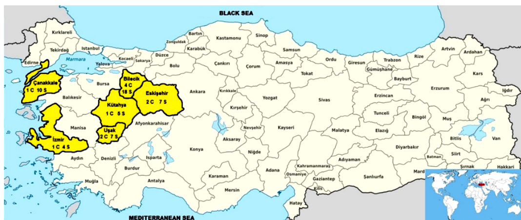
Figure 1. The provinces where ceramic samples are taken in Turkey (with company and sample numbers).

Where D is absorbed dose rate in air (nGy/h), DCF is dose conversion factor (0.7 Sv/Gy), OF is indoor occupancy factor (0.8) and T is annual exposure time (8760 h/y) (12) .