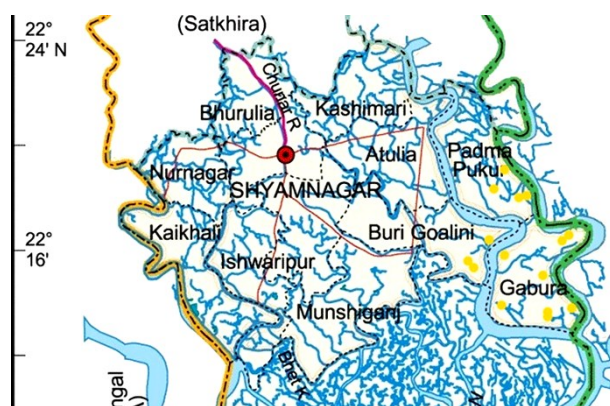
Figure 1. Map for sample collection location.

bulk samples detector efficiency could vary as it depends on the volume and the distance of the samples. In the present study a reliable efficiency vs energy curve for the HPGe gamma-ray detector was determined by measuring the known activity of the uranium standard reference materials (RGU-1), thorium standard reference materials (RGTh-1) and potassium standard reference materials (RGK-1) provided by the IAEA, Vienna (15) .