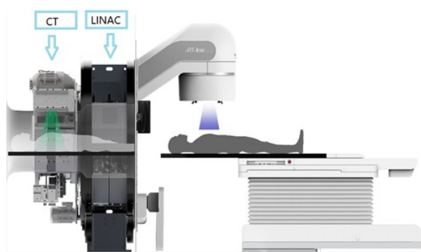
Figure 1. The linear accelerator of United Imaging Healthcare's CT linac URT-Linac 506C.

For prostate and Multi Target cases, seven fields at 50° intervals from the vertical (0°, 50°, 100°, 150°, 310°, 260° and 210°) and one full arc (179° to 181° with a collimator angle 30°) were chosen for IMRT and VMAT plans respectively. For head-and-neck and C-shaped tests, nine fields at 40° intervals from the vertical (0°, 40°, 80°, 120°, 160°, 320°, 280°, 240° and 200°) for IMRT and two complimentary full arcs were used for VMAT. For all VMAT plans we maintained the collimator angle at ±30° while for IMRT plans 0° collimator angle was applied throughout.