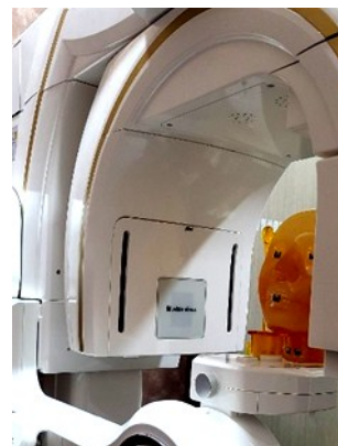
Figure 1. ESD measurement using optically stimulated luminescence dosimeters.

Statistical analyses were performed using SPSS Statistics version 25.0 (IBM Corp., Armonk, NY, USA), and P < 0.05 was considered significant. For the comparative analysis of differences based on values exceeding-the-DRL, the nonparametric Mann-Whitney U test was performed. Data for variables were represented using mean and standard deviation values.