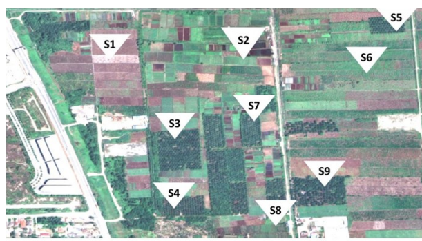
Figure 2. Location of the soil samples taken in the farm located in Klang, Selangor.

An overall total of nine soil samples (S1 to S9) were collected from the study site and transferred to the laboratory in a sealed plastic bag, with each plastic bag being labelled with the required information. All big stones in the soil samples were removed, and the entire sample was sieved in