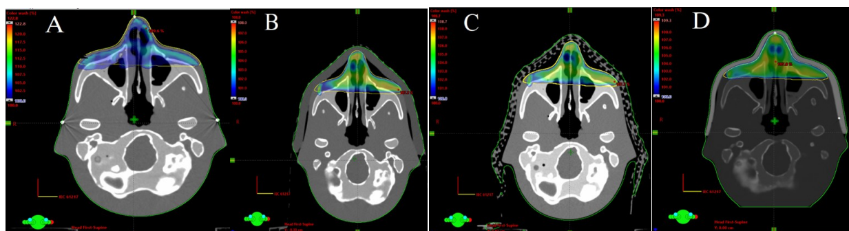
Figure 2. Comparison of plans for simulating nasal radiotherapy with different boluses. (A) Bolus free, (B) Commercial bolus (wax), (C) Thermoplastic masks bolus, (D) 3D printing bolus based on FDM @TPU 92A material.