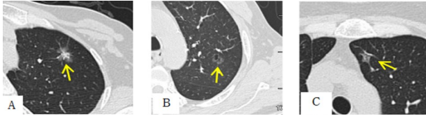
Figure 1. Legend of CT signs of minimally invasive adenocarcinoma (MIA) with EGFR gene mutation. A: CT scan of a 54-year-old woman showing a mixed ground-glass opacity (GGO) nodule in the upper lobe of the left lung, measuring approximately 1.5 cm in diameter, with a visible spiculation sign (indicated by the arrow). B: CT scan of a 48-year-old man depicting a GGO nodule in the upper lobe of the left lung, measuring approximately 1.0 cm in diameter, with a visible vacuole sign (indicated by the arrow). C: CT scan of a 68-year-old woman showing a GGO nodule in the upper lobe of the left lung, measuring approximately 1.1 cm in diameter, with a visible vascular convergence sign (indicated by the arrow). GGO, ground-glass opacity.

(approval number: Jiangsu Drug Administration (quasi) word 2016 No. 20160001 China) for fixation, dehydration, transparency, embedding, sectioning, and processing with the use of hematoxylin-eosin (HE) staining (Beijing Yili Fine Chemicals Co., LTD. China). The diagnosis of MIA was verified by two pathologists after consultation, on the basis of the 2021 pathological criteria for lung adenocarcinoma (19). Pathological images of MIA illustrated in figure 2.