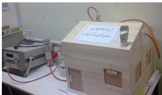
Figure 1. The wooden model house used in this study.

Radon level measurement was performed by using a PRASSI portable radon gas survey meter. On the other hand, for assessment of the ventilation and indoor air quality, a Testo 435-2 multi-function measuring instrument was used.