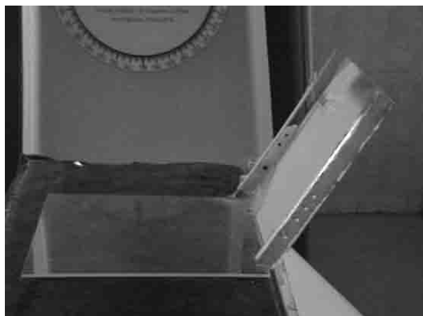
Figure 1. The dedicated cassette holder made from perspex is shown on the treatment couch.

Qualitative analysis was obtained by means of the questionnaire handed to the three radiation oncologists. The images after