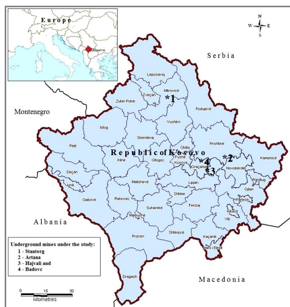
Figure 1. Location map of Kosovo underground mines under the study.

Underground miners are also the subject of the external gamma radiation. The gamma exposure (dose rate) was determined using fully