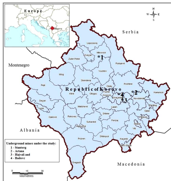
Figure 1. Location map of Kosovo underground mines under the study.

Underground miners are also the subject of the external gamma radiation. The gamma exposure (dose rate) was determined using fully