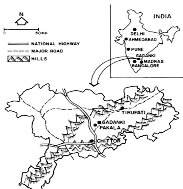
Figure 2. Location of NARL, Gadanki, India.