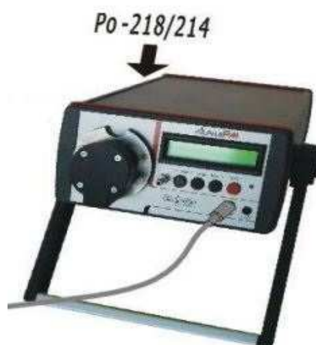
Figure 1. Typical alpha progeny meter (Saphymo GmbH).

Continuous observations were carried out at the National Atmospheric Research Laboratory (NARL), Gadanki ( 13.5^\circ\text{N} , 79.2^\circ\text{E} ), a rural tropical warm location in peninsular India, about 2 km away from main residential areas with no major industrial activities. The locative map and topography of NARL is shown in figure 2, respectively. Gadanki region experiences both summer (Southwest) and winter (Northeast) monsoons. Overall wind direction was southerly and southeasterly during April, westerly from May to September and northeasterly during October and November (13) .