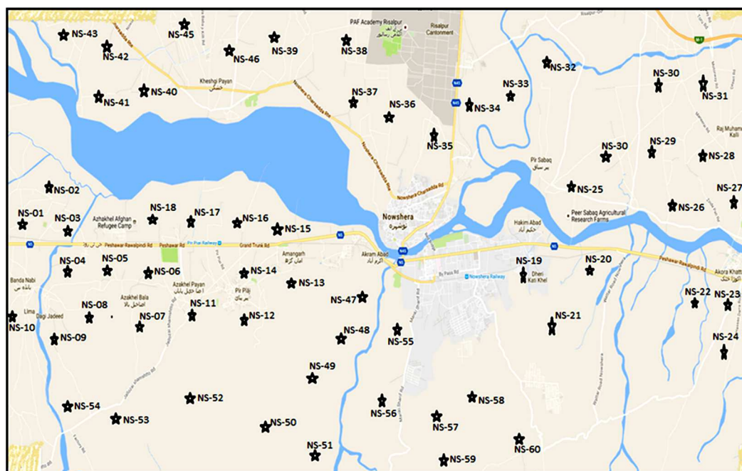
Figure 1b. Map of Nowshera area and location of sampling sites (NS1 to NS60).