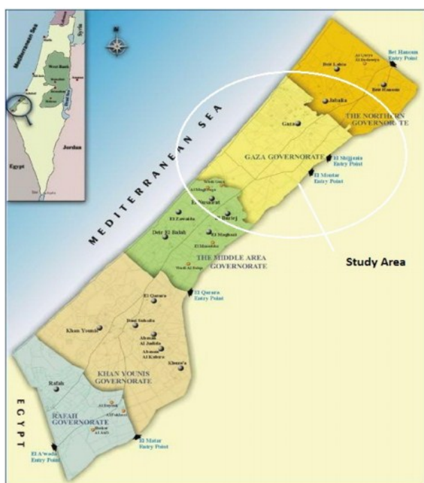
Figure 1. Gaza strip map and study area.

from the basement floor to fourth floor for two months from March to June of 2006. Only 154 dosimeters were found in the places and collected, while the remaining 26 dosimeters were lost. The United States Environmental Protection Agency (USEPA) indoor radon and radon decay product measurement device protocols were taken into account when selecting the location of detectors (19) .