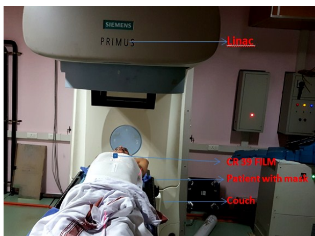
Figure 1. Irradiation set up of Siemens Primus Plus medical linac.

brightness of each elliptical track in the image was obtained. The recoiled proton energy corresponding to each track was calculated from the track diameter by using a calibration graph. The calibration graph data was taken from the combined work of Matiullah Tufail M et al. , N. Sinenian et al. and Antony Joseph (12, 13, 14) . The equation to best fit data is calculated and is given by E_p = (0.0295956*(d^2)) + (-1.16821*d) + 12.674 , where d is the track diameter. Then the corresponding neutron energy is calculated using the equation E_p = E_n \cos^2 \theta , where E_p is the energy of the proton, evaluated in the previous step, E_n is the neutron energy and \theta is the recoil angle.