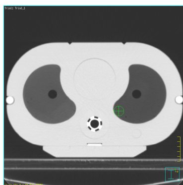
Figure 2. CT of phantom in the treatment planning system.