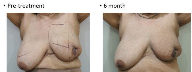
Figure 2. Example of a patient treated to the left breast with a poor cosmetic result: induration and hyperpigmented skin were detected at 6-month follow up.