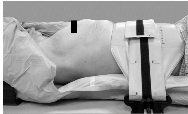
Figure 2. PACB device, the pressure band with scales.

All patients were placed in a supine position, they were asked to breathe quietly, and laid on a vacuum cushion for computed tomography (CT) simulation and treatment. The patients fasted for more than 4 hours before the CT simulation or radiotherapy. 4DCT scanning was performed with or without a PACB. The PACB device consists of a pressure band with scales, a pressure gauge and an inflation compression device (Body Pro-Lok ONE, Orange City, Iowa). The patients laid on the vacuum cushion, the pressure band was tied to the abdomen of the patient, and the scale measurements were recorded at the same time. The superior edge of the band was at the inferior border of the patient's ribs (figure 2). The inflation compression device can inflate and pressurize the abdominal belt to 2 kPa.