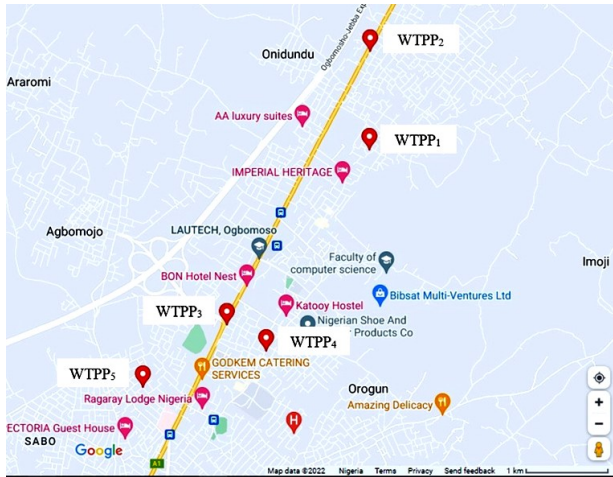
Figure 1. Satellite view of the sampling locations.