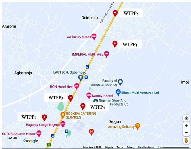
Figure 1. Satellite view of the sampling locations.