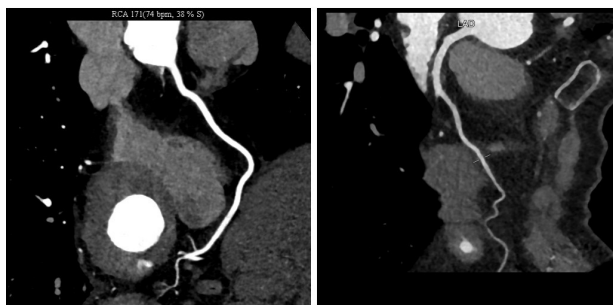
Figure 2. (a); The female patient, 53-year-old, BMI was 27.8\text{kg/m}^2 , contrast injection rate is 4.0\text{ ml/s} , 48\text{ml} , contrast dosage, the average CT value of the RCA is 692.1\text{ HU} , CPR shows excessive "bright" of the right coronary artery lumen, image quality score is 1 point. (b); The female patient, 62-year-old, with a BMI of 27.0\text{kg/m}^2 , contrast injection rate is 3.0\text{ ml/s} , 30\text{ml} contrast dosage, left anterior descending lumen mean CT value of 412.6\text{HU} , LAD soft plaque shows clearly, and see calcified plaque (arrow) image quality score of 1 point.