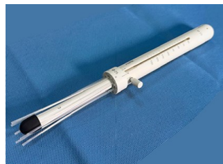
Figure 1. The applicator has seven channels, including one central channel and six surrounding channels, with a radius of 2.5 cm.

MC applicators for patients with vaginal cancer are designed considering their anatomy. These applicators consist of either seven channels, including a central channel with a radius of 2.5 cm and six surrounding channels (figure 1); nine channels, including a central channel with a radius of 3 cm and eight surrounding channels (figure 2); or nine channels, including a central channel with a radius of 3.5 cm and eight surrounding channels (figure 3). Patient characteristics are described in table 1.