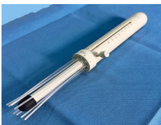
Figure 2. The applicator has nine channels, including one central channel and eight surrounding channels, with a radius of 3 cm.