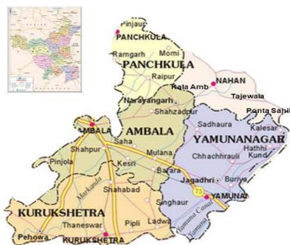
Figure 1. Map of the study area.

The Haryana state of India can be subdivided into two natural areas i.e. Sub-Himalayan terrain and the Indo-Gangatic planes. The plane is fertile and the height above the sea level is 700-900 ft. The slope is from north to south. The climate of the