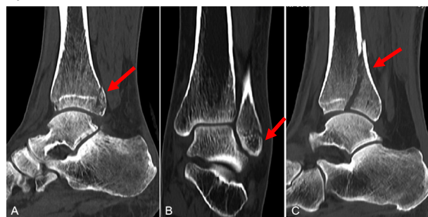
Figure 1. A 5-point Likert-type scale was utilized to assess the subjective quality of CT images and to gauge the influence of this subjective image quality on clinical decision-making related to fractures (indicated by the red arrow) A 3, Qualified; B 4, Good; C 5, Excellent.

Subjective image quality (16) : At the Siemens CT post processing station (syngo.via), images were anonymized. The quality of these images was subjectively evaluated by two senior radiologists, while two orthopedic physicians assessed the impact of image quality on the treatment plan. Evaluations were performed using a double-blind 5-point Likert scale (5=excellent; 4=good; 3=qualified; 2=poor; 1=very poor; 3 was the chosen cutoff quality, figure 1).