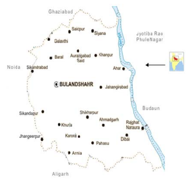
Figure 1. The map showing the study area.