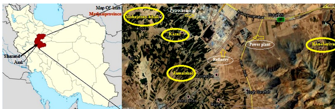
Figure 1. Sampling location map showing study area, Khanemiran, Mahajeran-khak, Kazaz and Jamalabad around of SRC.

Shazand refining and petrochemical plants are located in the city of Shazand in Markazi province in Iran at kilometer 22 of the Arak-Khoramabad road and have been built on an area of 523 hectares. One of the largest producers of oil components, polymers and chemical products, as well as one of the most important projects in Iran was built in 1992 (8) . There are several chimneys that spread fly ash from combustion to the environment.