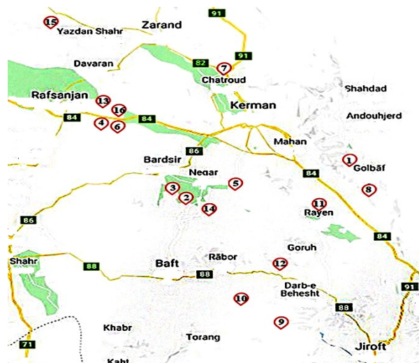
Figure 1. Map of the study area provided with numbers associated with 16 locations of hot springs according to classification in terms of number of each hot spring as shown in table 1 (Modified from Google Maps).

standard conditions, and were transferred to the laboratory, and ultimately radon concentration was measured in the samples.