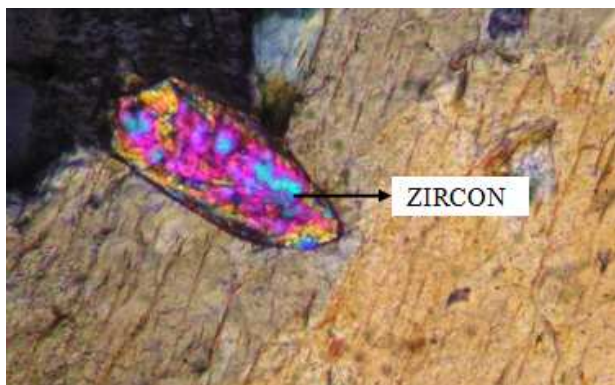
Figure 2. A zircon mineral in the granite sample collected from studying area.

The XRD analysis was carried out on all of the rock samples. Figure 3 shows XRD analysis of the Rock 11. Although there is not much Zr in the sample, some of the zircon peaks were observed under the background, and some of them overlap with albite and quartz peaks. Thorite and baddeleyite compounds and zircon element were observed with fewer amounts in the rock sample. Also, the thin section investigation of the granite samples supports the presence of zircons in the sample (figure 2).