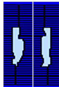
Figure 1. The simulated MLC configuration for the medial and lateral tangential breast fields using the exported plan data from TPS.