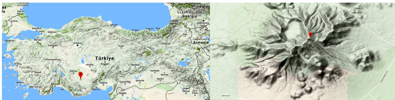
Figure 1. A map of Karadağ Mountain, Turkey (study area).

at the latitude of 37.25°N and the longitude of 33.08°E. It's between the Mediterranean region and the central Anatolia region of Turkey (figure 1). It is about 25 km north of Karaman. The peak of the mountain is 2.25 km east of this plain and its altitude is 2271 m.