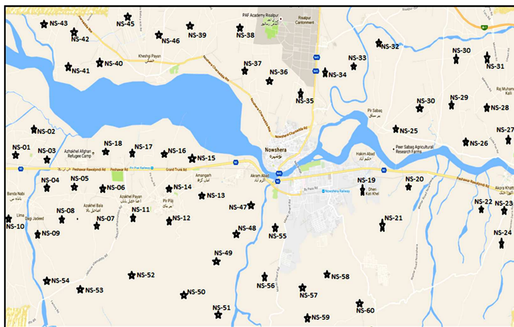
Figure 1b. Map of Nowshera area and location of sampling sites (NS1 to NS60).