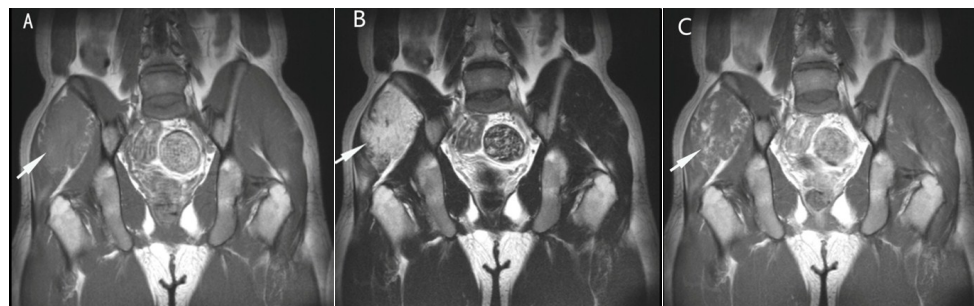
Figure 3. MR findings of the lesion. A. T1 weight MR presented slight hyperintensity. B. T2 weight MR exhibited asymmetrical hyperintensity and small foliated hypointensity. C. Enhanced MRI scan showed uneven and moderate reinforcement of the lesion.