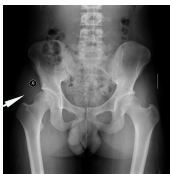
Figure 1. X-ray examination showed no obvious ossification of the right buttock.

Pathological examination revealed vascular structures of varying sizes in the striated muscle with thrombopoiesis, thrombus organization, hemosiderin deposition, and focal ossification (figure 5A, B). Immunohistochemistry showed the vasculature cluster of differentiation 31 and 34 were positive. The myoideum desmin and actin were positive while the D2-40 and S-100 were negative. About ten percent of the Ki-67 was positive, and very few P53 were also positive. The pathological diagnosis was ossified intramuscular hemangioma.