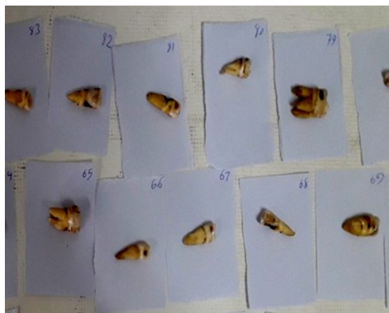
Figure 1. Samples dried at 100°C for 2h.

Where \rho and \rho_b are the number of alpha tracks of the samples (track cm -2 ) and the number of background tracks in the CR-39 detector, respectively, k is the conversion coefficient of 0.0878 track cm -2 Bq -1 day -1 m 3 used to convert alpha track density into radon radioactivity concentration, and t is the exposure time (days). The background track density analysis was performed on a blank detector stored alone.