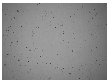
Figure 2. Alpha track density on CR-39 of a typical tooth sample.

In the male subjects aged 50 years old and above, the alpha track density values were observed to be lower than those of the other age groups ( P<0.001 ).