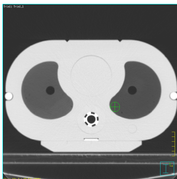
Figure 2. CT of phantom in the treatment planning system.