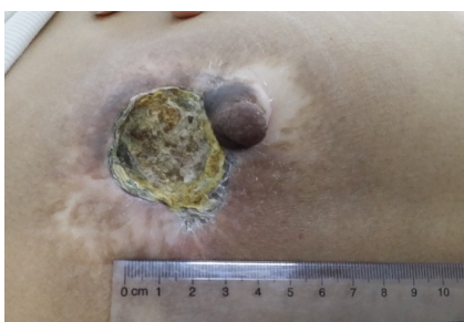
Figure 4. The tumor condition after 2.5 months.

The patient recovered well after the therapy. She was followed-up once per month for the first three months after her discharge, and then once every three months until January 2019. Figure 4 shows the breast mass condition in January 2017. The mass shrank, the ulcer wound had no overt bleeding or exudation, and no necrosis of the nipple was found. Liver cancer had not progressed. The patient has survived during the follow-up to this day.