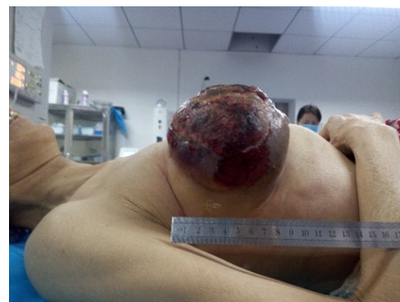
Figure 1. Huge right breast cancer mass before treatment.

Physical examination after admission found that the left breast was normal, while the right breast was swollen (figure 1). The right breast lump was about 13.0 cm × 11.0 cm and located in the upper outer quadrant without pain or nipple discharge. The surface of the lump was red and swollen. The activity of the lump was poor. The large lesion slightly restricted the right upper extremity. Also found was an isolated swollen axillary node of about 2.5 cm × 3.0 cm and weak activity.