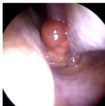
Figure 1. Endoscopic view of the mass in the left nasal cavity. A smooth, easily bleeding mass was noted around the left inferior nasal turbinate.

lambda light chains. Based on these features, the pathologist diagnosed the patient with extramedullary plasmacytoma in the left nasal cavity. Due to the small size of the lesion and the absence of additional symptoms, the patient was initially considered to have a solitary extramedullary plasmacytoma.