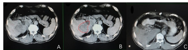
Figure 1. CT scanning of a HCC patient with PVTT. A, pre-radiotherapy CT image; B, A planning scheme for radiotherapy; C, Re-examination with CT scan 2 months post-radiotherapy.

Upper abdominal CT or MRI review one month after radiotherapy showed 3 primary lesions CR, 27 PR, 10 SD, and 13 PD, with a response (CR + PR) rate of 56.6% (30/53); 2 tumour thrombi CR, 28 PR, 11 SD, and 9 PD, with a response (CR + PR) rate of 56.6% (30/53). Figure 1 shows the case of a patient with PVTT CR.