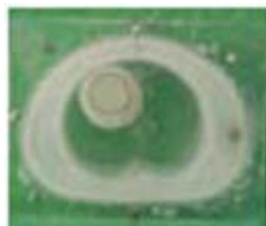
Figure 1. Transverse section of the heart and chest phantom composed of four cylinders, 15 cm long, which represent soft tissue of body contour, lungs, heart wall, and internal blood of the heart.

In this program a non-corrected tomogram of the predefined slice of the phantom was calculated f^0 , using first iteration of MLEM algorithm and zero attenuation map \mu^0 = 0 , (8) . Base on this image data and its sinogram g_i , values of q_{i,j} and \tau_j were calculated to be used with system matrix a_{i,j} for estimation of attenuation map for next iteration \mu^{k+1} through optimization of \sum_{l=1}^m C_l^{p,q} \mu_l = \sum_{i=1}^n \sum_{j=1}^m \left( q_{ij} - \tau_j a_{ij} e^{-s_p \frac{1}{w_q}} \right) \sum_{k \in k_{ij}} r_{ik} \mu_k with constrains used in problem 5. The attenuation corrected emission SPECT image of the next iteration can then be calculated from f_j^{k+1} = \tau_j^k / \sigma_j(\mu^{k+1}) .