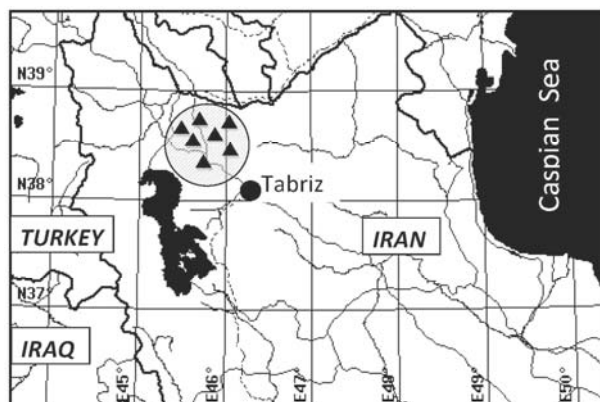
Figure 1. Simplified geology of Northwestern Iran. Locations of soil sampling is shown by solid triangles.

were carefully collected from areas, which were not covered by any type of vegetation and thought to be undisturbed. We grounded thoroughly homogenized and changed the rock samples into the powder form before the measurements. All soil samples and building materials converted into very small particles and screened with a sieve of about 1mm mesh. The prepared and homogenized samples were weighted and put into Marinelli beakers with the volume of 1 liter and flat vessels 0.1, 0.2 and 0.5 liter volume. Then they were packed into radon-impermeable plastic containers. Each beaker was kept for 4 weeks (>seven half-lives of ^{222}\text{Rn} and ^{224}\text{Ra} ) prior to counting in order to ensure that the daughter products of ^{226}\text{Ra} up to ^{210}\text{Pb} and of ^{228}\text{Th} up to ^{208}\text{Pb} achieve equilibrium with their respective parent radionuclides (12) .